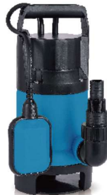
SPB-3 Grain Size: 35mm