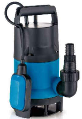
SPB-2 Grain Size: 35mm