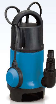
SPB-1 Grain Size: 35mm